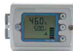
Digital Duct Humdistat