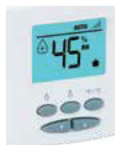
Digital Wall Humdistat