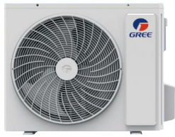
Crossover condensing unit