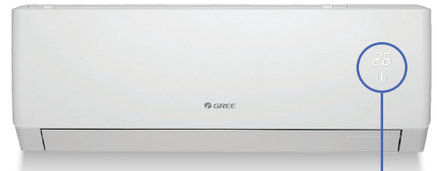
Crossover wall-mounted unit