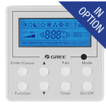
Wired controller (XE-71)